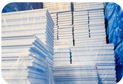
XPS Thermal Insulation Board