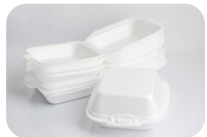
Foam Lunch Box