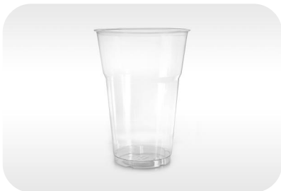
Disposable Plastic Cup